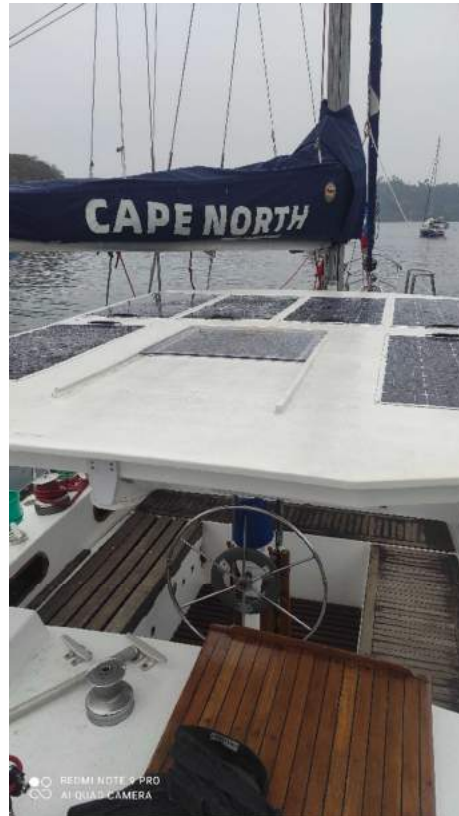
91_roof_with_solarpanells Roof new 1/2023