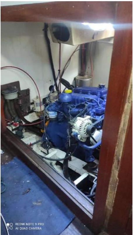
64_navtable_to_enginerroom ( sliding_doors_removed )