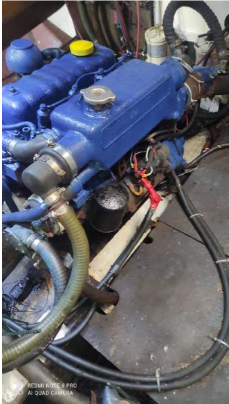
66_engine_port_side_oilfilter_starter heat exchanger and raw water pump